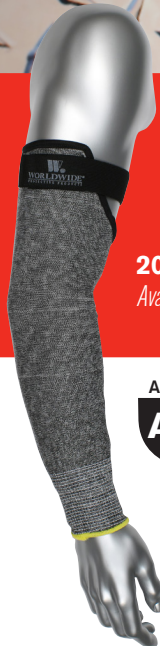
20-S13ATA/PE4-VEL Available with and without thumb hole