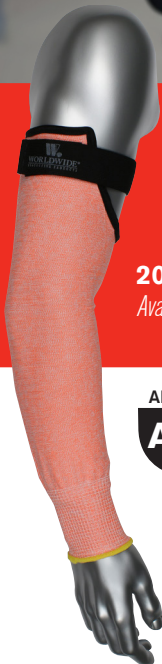
20-S13ATA/PE4HVO-VEL Available with and without thumb hole