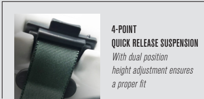
4-POINT QUICK RELEASE SUSPENSION With dual position height adjustment ensures a proper fit

Construction // Tower Climbing // Oil & Gas Wind Turbines // Arborists // Rescue