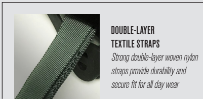
DOUBLE-LAYER TEXTILE STRAPS Strong double-layer woven nylon straps provide durability and secure fit for all day wear