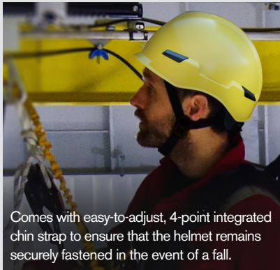
Comes with easy-to-adjust, 4-point integrated chin strap to ensure that the helmet remains securely fastened in the event of a fall.

Features a super lightweight Polycarbonate/ABS shell and a integrated hi-density inner shell foam liner that work in conjunction with the highly adjustable 4-point nylon inner suspension to provide exceptional protection from top of head and lateral impact hazards.