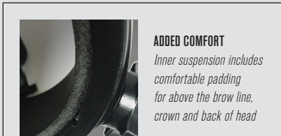
ADDED COMFORT Inner suspension includes comfortable padding for above the brow line, crown and back of head