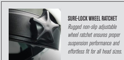
SURE-LOCK WHEEL RATCHET Rugged non-slip adjustable wheel ratchet ensures proper suspension performance and effortless fit for all head sizes.