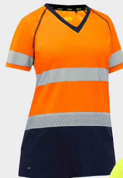
312W1118T > ANSI 107 Type R, Class 2