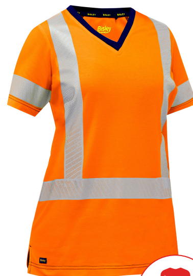
313W1118H > ANSI 107 Type R, Class 2