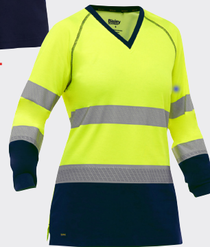
313W6118T > ANSI 107 Type R, Class 3