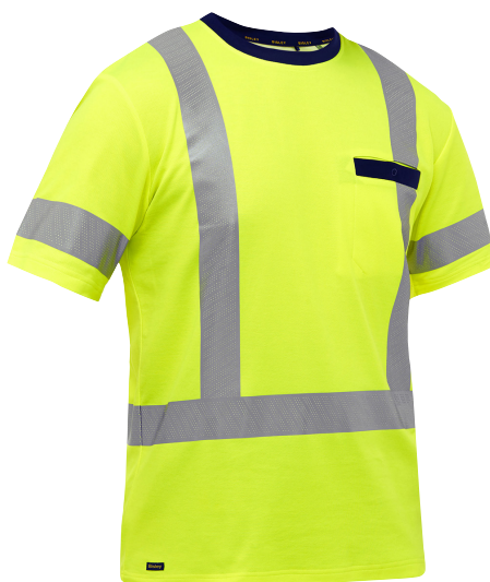
313M1118H > ANSI 107 Type R, Class 3

BIOSCIENCE FRESCHÉ ® ANTIMICROBIAL TREATMENT