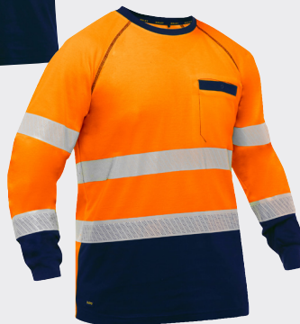
313M6118T > ANSI 107 Type R, Class 3