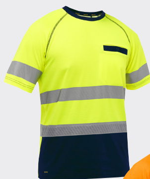
312M1118T > ANSI 107 Type R, Class 2

BIO SCIENCE FRESCHÉ® ANTIMICROBIAL TREATMENT